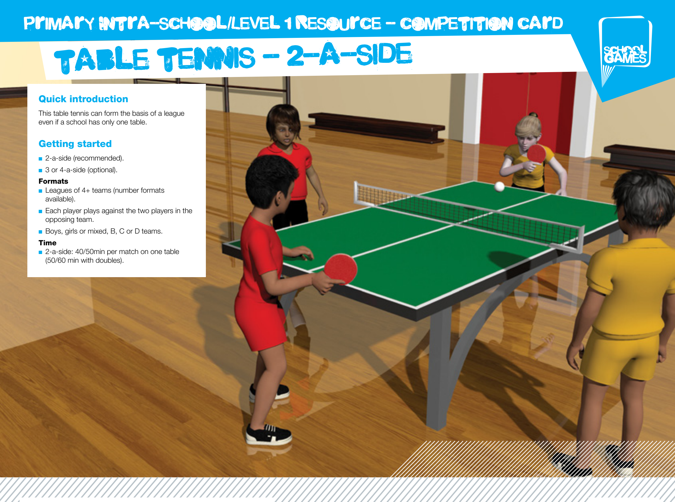
TABLE TENNIS - 2-A-SIDE